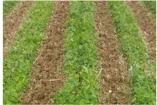
Understory white clover living mulch before and after strip tillage.