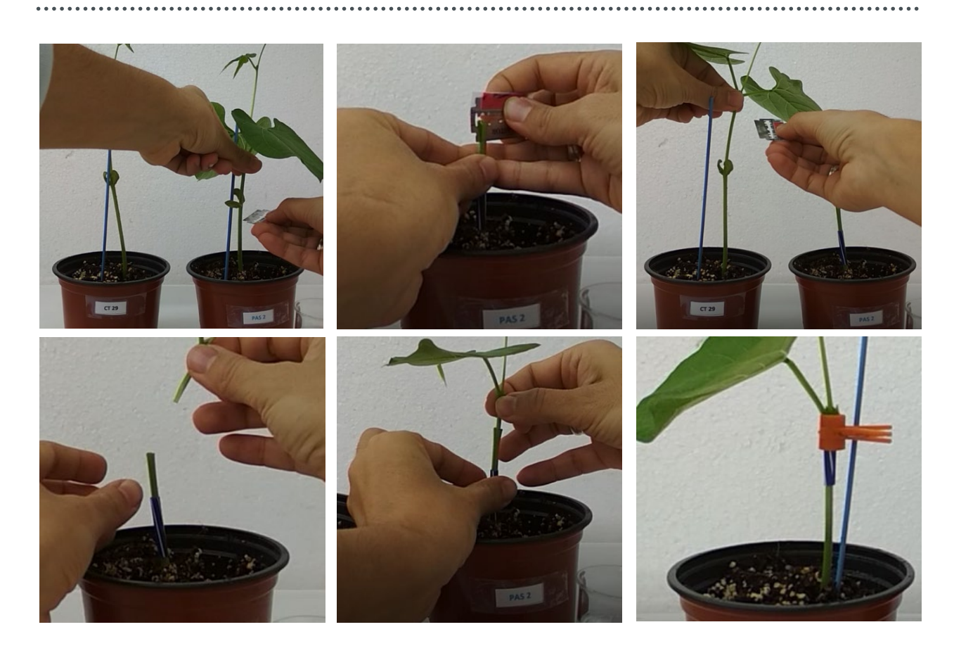
Figure 1. Grafting of a common bean plant.